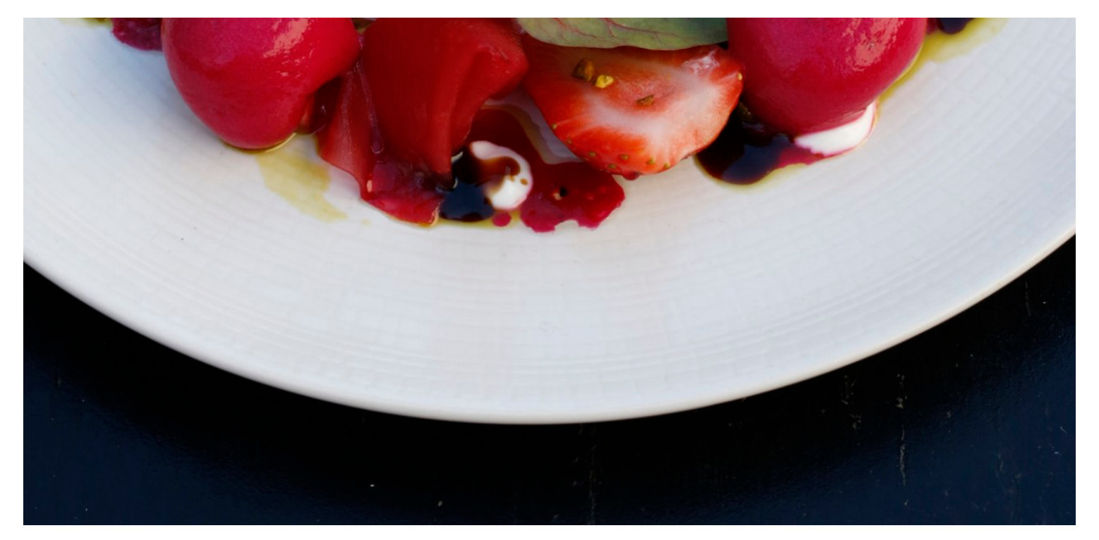
Beetroot and fruit salad with ajoblanco sorbet

What was the essence of their experience with Adrià?