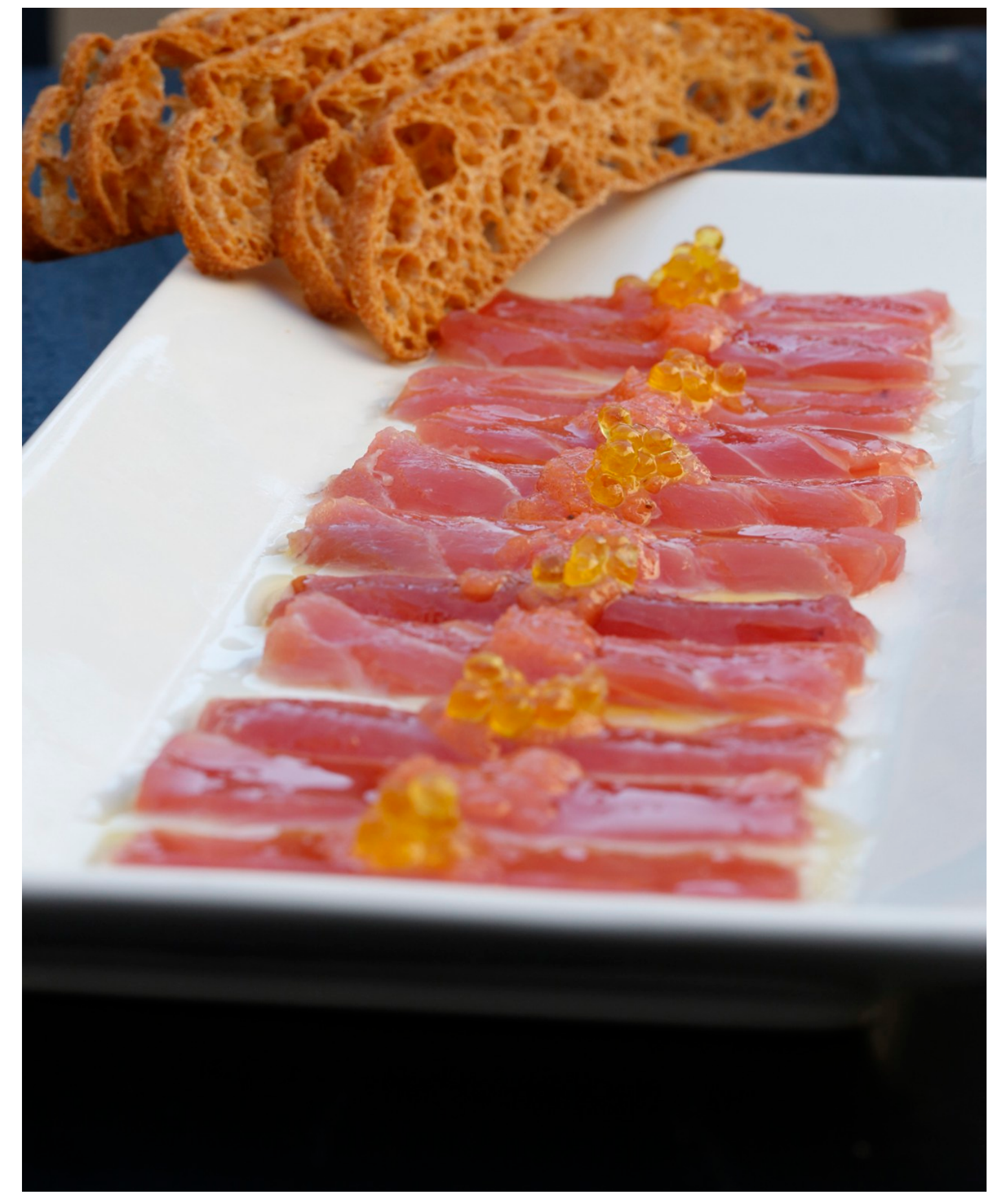
Red tuna Ibérico.

One of their signature dishes, red tuna Ibérico (using sustainable fish from Balfegó ), showed their characteristic deceptive simplicity. An immense amount of work had gone on behind the scenes into rendering Ibérico ham fat, making the most perfect tomato