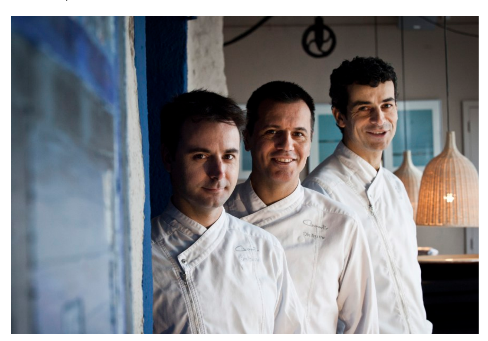
Chefs Oriol Castro, Eduard Xatruch and Mateu Casañas worked in the famed elBulli kitchen and now own and operatomultiple acclaimed restaurants in Spain.