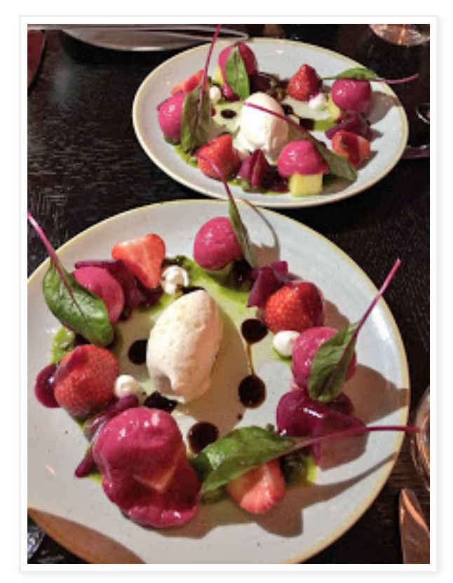
Beetroot and fruit salad with Ajoblanco sorbet.