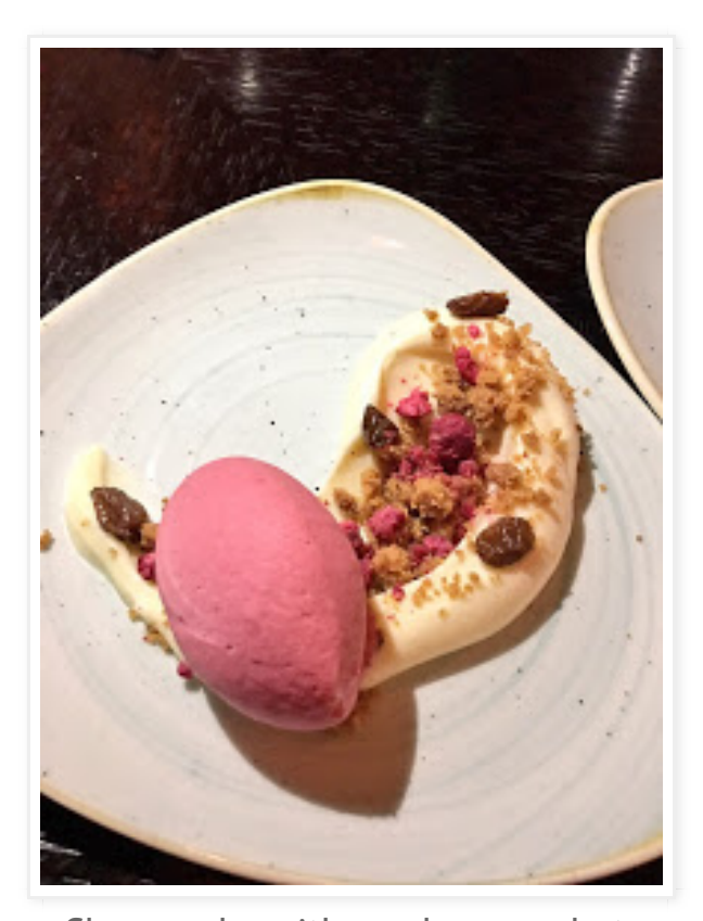
Cheesecake with raspberry sorbet.

Yes certainly, at Casa Marcial the location of the restaurant is important to my inspiration, the personality of the surrounding terrain inspires me... all around me there are the mountains and the house where I was born and where I still sleep ... so yes the terrain and history gives me plenty of inspiration.