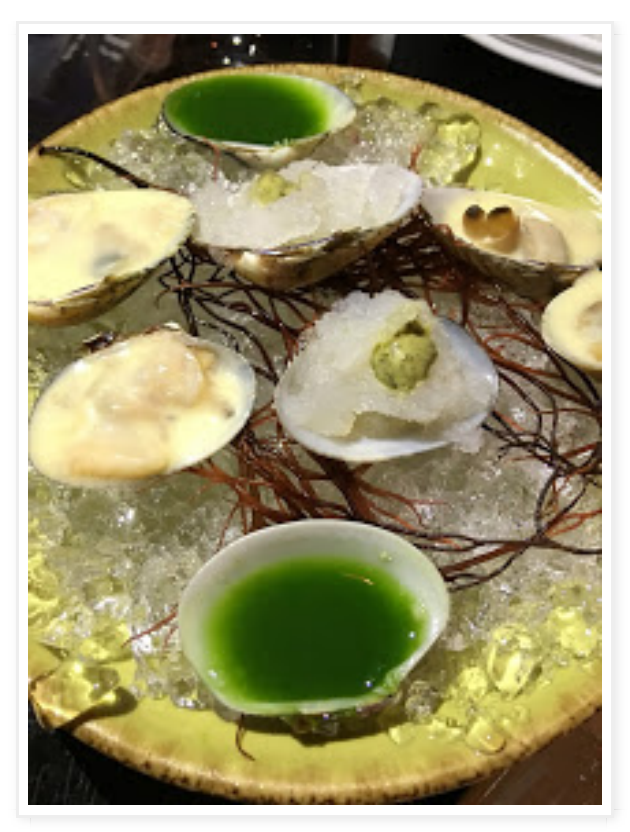
Natural clams with parsley juice and seaweed emulsion.