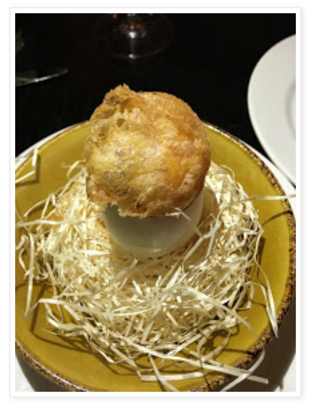
Crispy egg yolk with mushroom jelly.

vision but also an emotional experience.