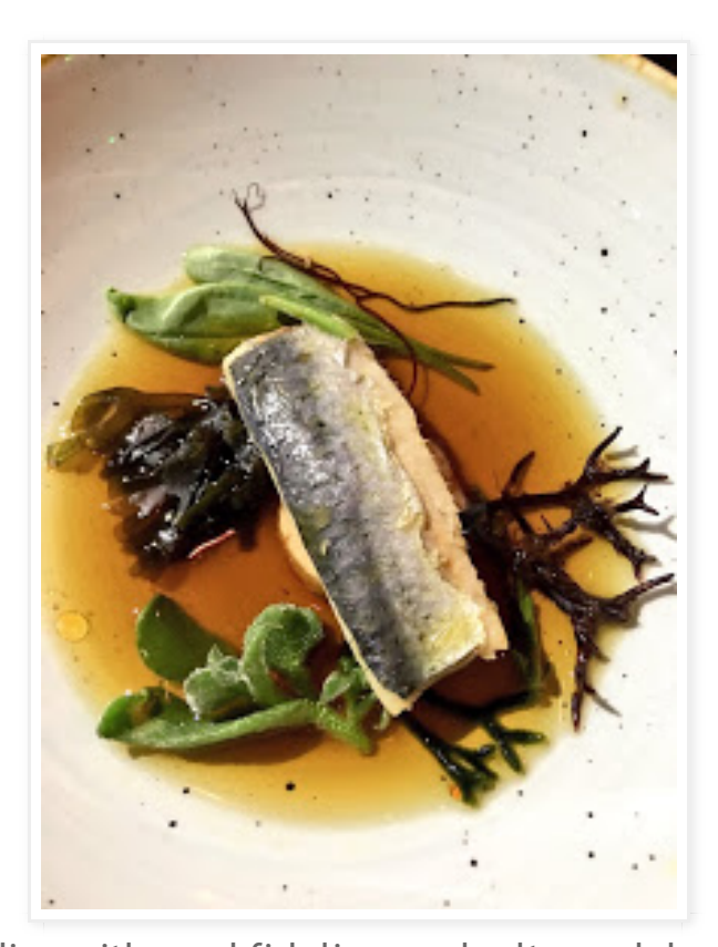
Sardine with monkfish liver and salt marsh herbs.